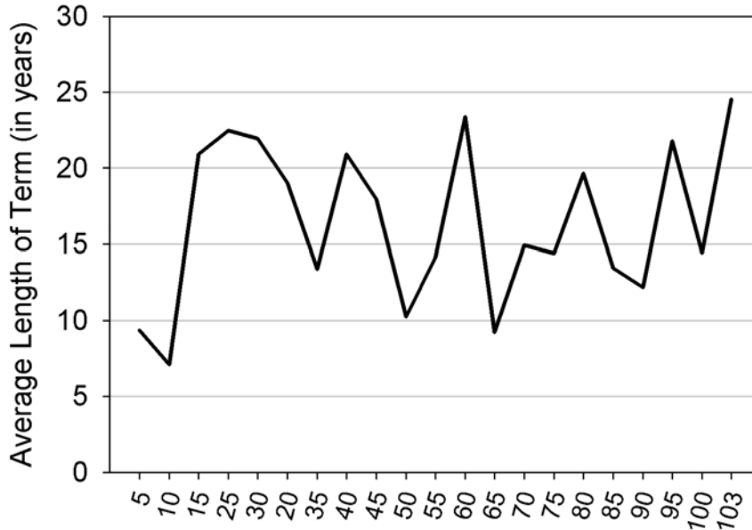
Chart 2 Average Length of Term, in Groups of 5

An even less convincing argument, closely related to the “dramatic recent increase” claim, is that the length of tenure today has disrupted the expectations of the founders. Calabresi and Lindgren argue that improvements in medicine and increases in average life expectancy have caused a fundamental change in “the real-world, practical meaning of life tenure,” 165 producing a system that is “very different now from what it was in 1789.” When the Federalists and Anti-Federalists discussed their expectations, however, they contemplated even longer tenure on the courts than we have seen to date. Federal Farmer No. 15 complained that judges with life tenure would serve “thirty or forty years.” 166 Meanwhile, Hamilton in The Federalist No. 79 assailed New York’s mandatory retirement age of sixty for judges on the grounds that “[t]he deliberating and comparing faculties generally preserve their strength much beyond