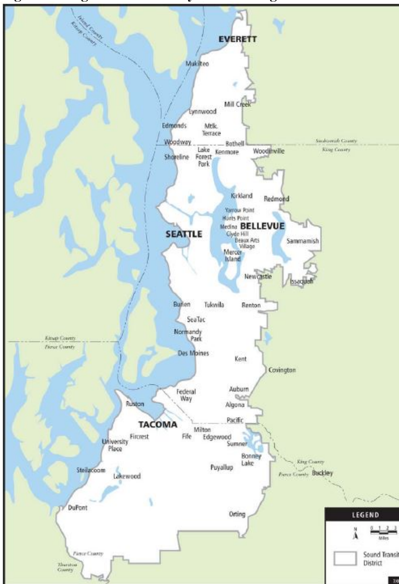
Figure 1: Region Governed by Central Puget Sound Transit District