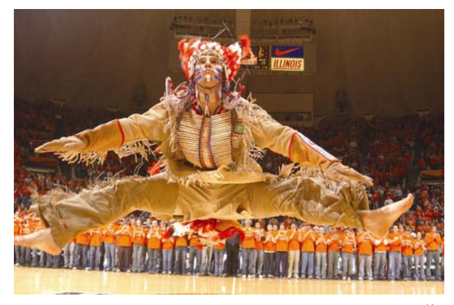
Chief Illiniwek, University of Illinois at Urbana-Champaign<sup>49</sup>

To stay on playing fields, I want to close with brief words, as promised, on the Chief as the University of Illinois's symbol. His image as literally the mascot of the historically white university and his recent reincarnation as a symbol, of all things, of multiculturalism allow us to reflect on how powerfully representations of universities as sites of admission, inclusion and liberalism can cloud critical inquiry. For eighty years the Chief has combined amateur enthusiasms for ersatz authenticity common to Indian-playing whites with out-and-out "scalp 'em" racism. During the last decade and a half of protests the Chief's image has been cleaned up slightly—no more Chief toilet paper and few Chief toilet seats, though Chief trash cans remain. The university has recently spent hundreds of thousands of dollars on a report on the Chief, hundreds of thousands more losing a legal case after attacking the free-speech rights of faculty protesting the mascot, seen trustees attempt to interfere in a departmental employment decision regarding an anti-Chief filmmaker, pressured its university press into rejecting a superb book critical of use of native American caricatures as mascots, lost an esteemed chancellor who broke ranks with pro-Chief opinion, found it virtually impossible to hire American Indian scholars and difficult to attract Indian students, and faced constant hostile questions