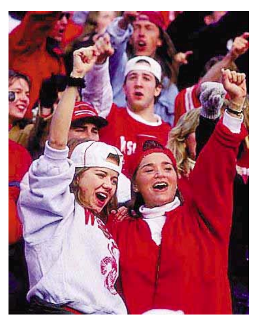
Original photo from University of Wisconsin-Madison football game