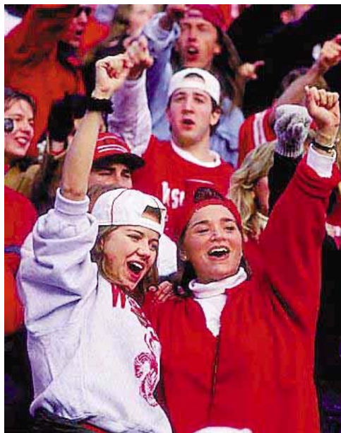
Original photo from University of Wisconsin-Madison football game