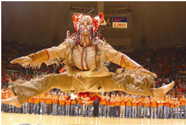
Chief Illiniwek, University of Illinois at Urbana-Champaign 49

To stay on playing fields, I want to close with brief words, as promised, on the Chief as the University of Illinois's symbol. His image as literally the mascot of the historically white university and his recent reincarnation as a symbol, of all things, of multiculturalism allow us to reflect on how powerfully representations of universities as sites of admission, inclusion and liberalism can cloud critical inquiry. For eighty years the Chief has combined amateur enthusiasms for ersatz authenticity common to Indian-playing whites with out-and-out "scalp 'em" racism. During the last decade and a half of protests the Chief's image has been cleaned up slightly—no more Chief toilet paper and few Chief toilet seats, though Chief trash cans remain. The university has recently spent hundreds of thousands of dollars on a report on the Chief, hundreds of thousands more losing a legal case after attacking the free-speech rights of faculty protesting the mascot, seen trustees attempt to interfere in a departmental employment decision regarding an anti-Chief filmmaker, pressured its university press into rejecting a superb book critical of use of native American caricatures as mascots, lost an esteemed chancellor who broke ranks with pro-Chief opinion, found it virtually impossible to hire American Indian scholars and difficult to attract Indian students, and faced constant hostile questions