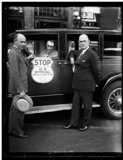
STOP WHEN YOU SEE THIS SIGN, Aug. 25, 1930

Black’s book traced those changes back to a single case: Carroll . 270