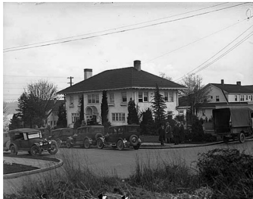
OLMSTEAD RESIDENCE (1925)

After Olmstead was convicted, he appealed on the theory that the transcripts should have been excluded because the wiretapping violated his Fourth and Fifth Amendment rights. 296