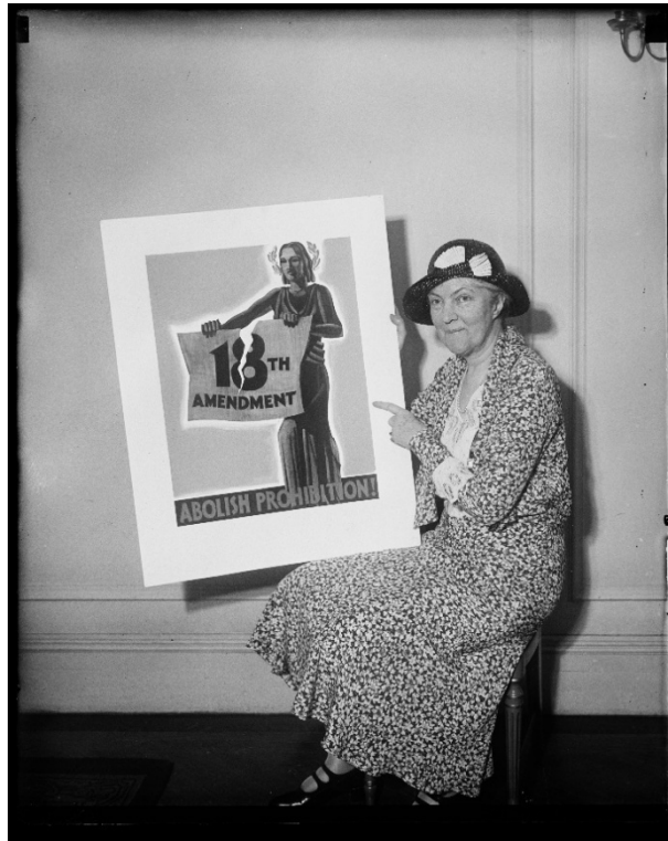
WOMAN POINTING AT ABOLISH PROHIBITION! POSTER (1931)

The day before Roosevelt’s landslide election in 1932, the Supreme Court continued its doctrinal balancing between the Fourth and Eighteenth Amendment, but for the first time, it was the Eighteenth Amendment that was forced to give—albeit in a rather inconsequential way.